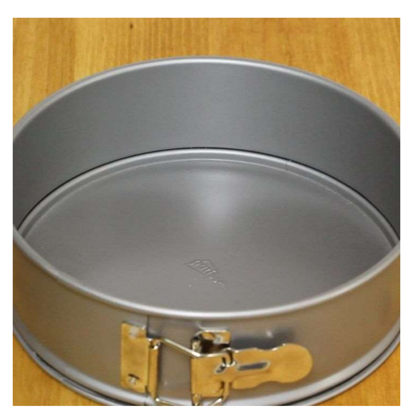
Tada! All clean. Instant rust remover.