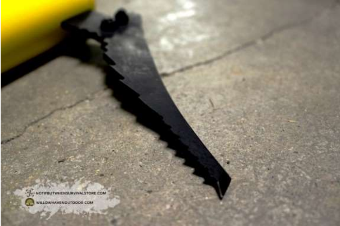
Silent Night Sucka'