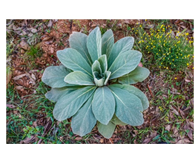
What Happens If You Smoke Mullein

Tags: How tonatural cureself-sufficiency Copyright © 2021 Ask a Prepper