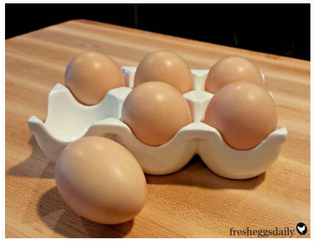
-ceramic egg carton from Amazon-

That being said, since we use our eggs so quickly and they are 'backyard coop fresh', I don't worry so much and usually keep a bowl of eggs on the kitchen counter that I use first and then store the rest in the fridge, topsy-turvy. Go figure.