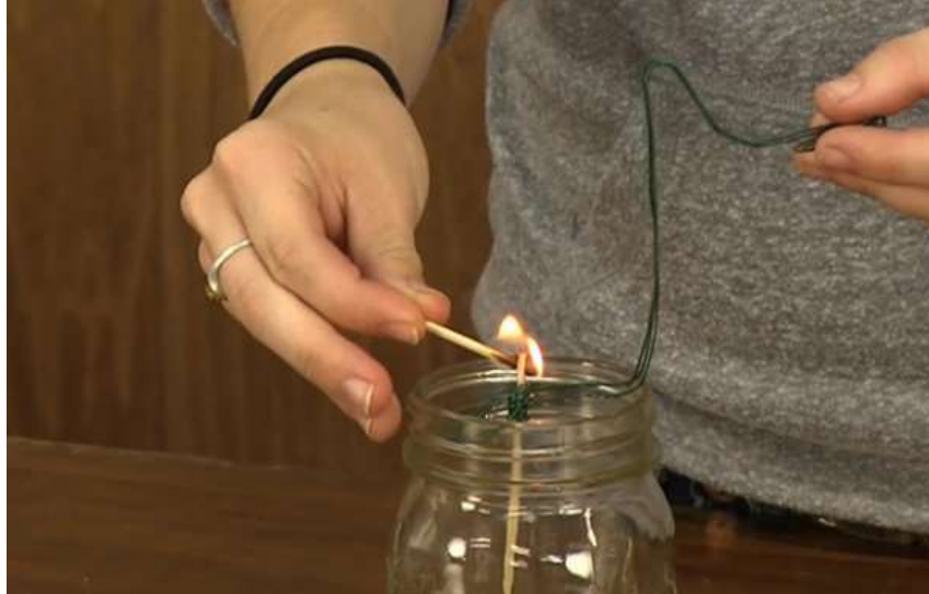
Your mason jar olive oil lamp is ready to light and use.