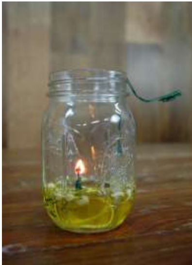
Gorgeous finished mason jar oil lamp