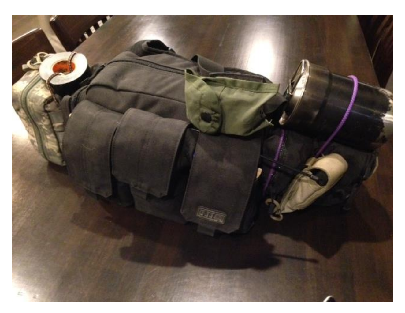
Bug out bag contents - outside

the bag unless it's something secured tightly and I need it immediately like ammo). It's also a bit too tactical-looking for my taste so it makes me stand out as it is. In 99% of cases, that doesn't make any difference and may even be an advantage in certain scenarios. If I were caught on my own in a societal collapse or similar, it could be a problem. In that case, I'd drape a light jacket over it on my shoulder and start looking for an acceptable replacement. In the meantime, I'll wait until I find just the right bag. It's hard to find a rugged incognito bag in the right size that isn't several times more expensive but you always need to be improving your fighting position. This one works for now and isn't designed for fully bugging out by itself anyway but I could if I had to with it.