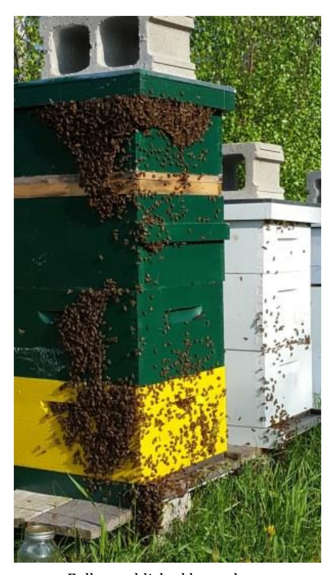
Fully established bee colony.

I truly believe that the growing numbers of backyard and homesteading beekeepers is vital to the survival of pollinators. The relationship between plant and pollinator has made our planet what it is today, and that relationship is at risk. By taking up the art of beekeeping, more and more people are coming to realize that these are more than mere stinging insects. There is a world of marvel that most of us never notice because they are small and we are big, because society has deemed insects "icky" and many of us shudder at the thought of getting close to a "bug". But beekeeping opens our eyes to the beauty of pollination, we begin to see insects in a new light-suddenly we see the magnificent color, shape, and characteristics of the beneficial insects all around us. We realize that we are part of this intimate relationship that plants have with their pollinators.