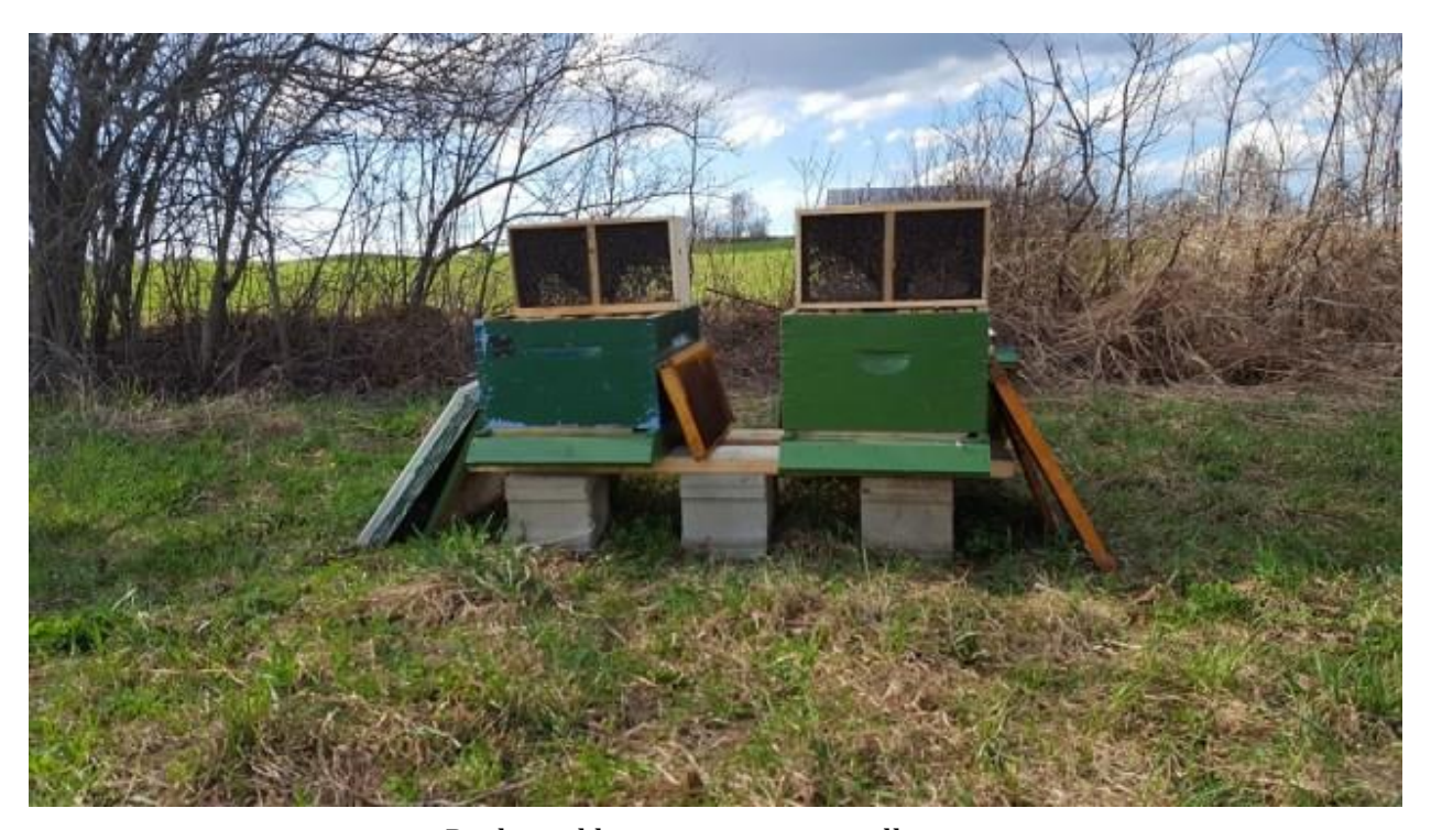
Packaged bees awaiting installation.