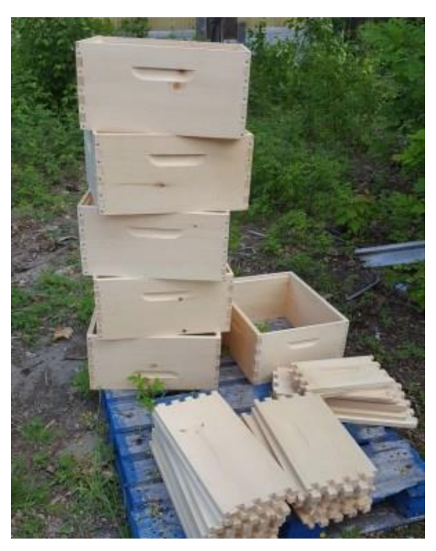
Assembling equipment, yourself can help save money when making that initial investment into beekeeping.

Before you bring home your bees, your hives should be completely assembled and set up at the location you have chosen for your apiary. All the frames should be put together, foundation inserted (if you're using it), the exterior of your boxes should be painted (or not-depending upon your principles), and you should have settled the hive components in place upon the foundation of your choice.