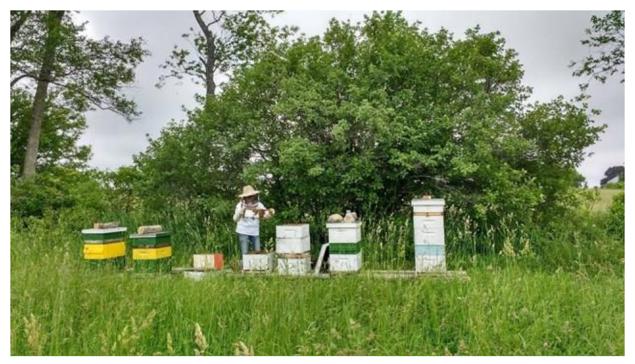
Site your apiary in a location that will keep hives dry, buffered from the wind, and with good sun exposure.

When you're trying to decide where to locate your apiary, consider the following carefully: