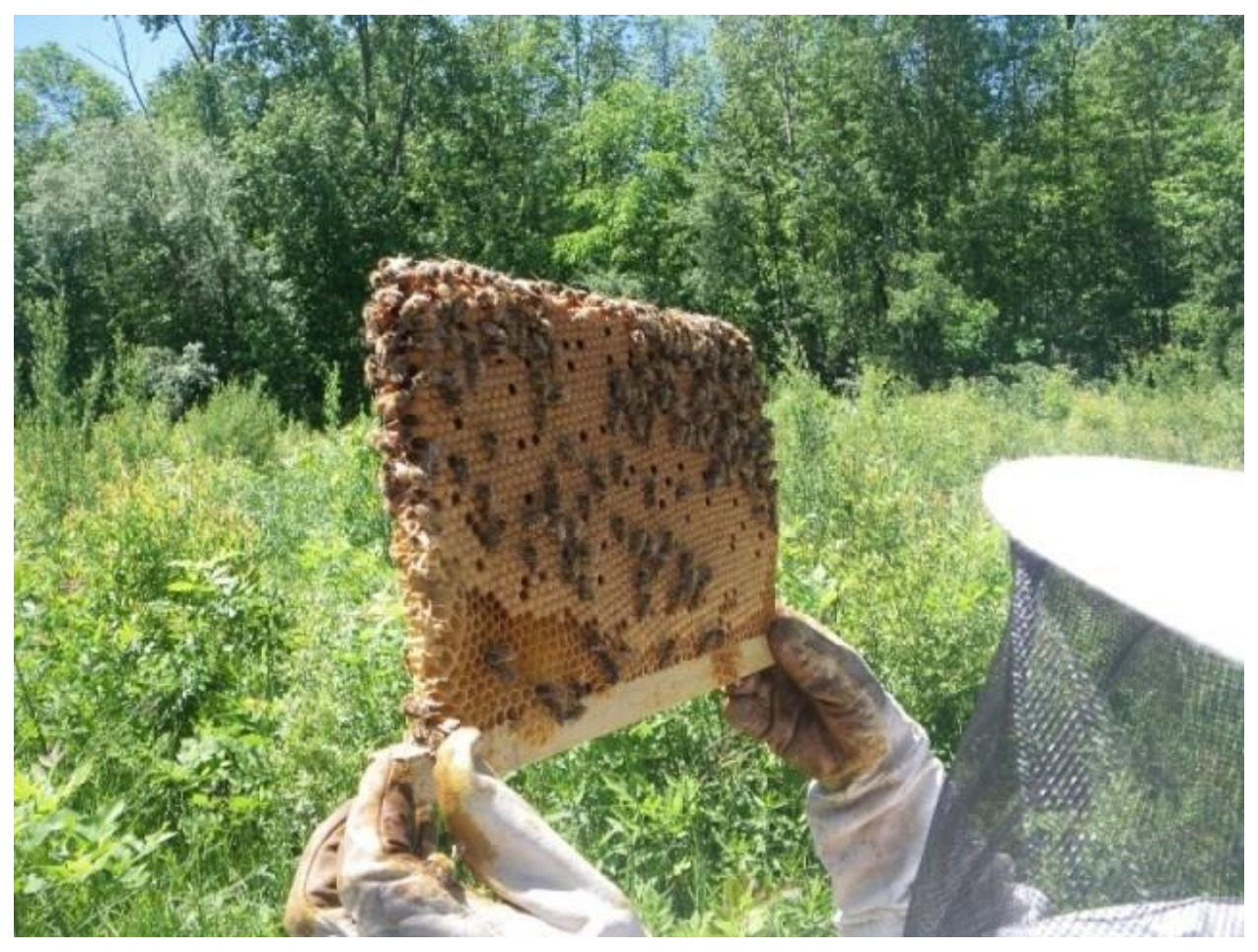
Examine each frame as you install your nucleus colonies.

Take this opportunity to inspect the condition of the Nuc you've received-does it contain larvae in all stages of development? (eggs, grubs, and capped pupa) Do the bees have frames containing both pollen and honey? If you see anything out of the ordinary, or suspect a problem, you should contact your bee-supplier immediately.