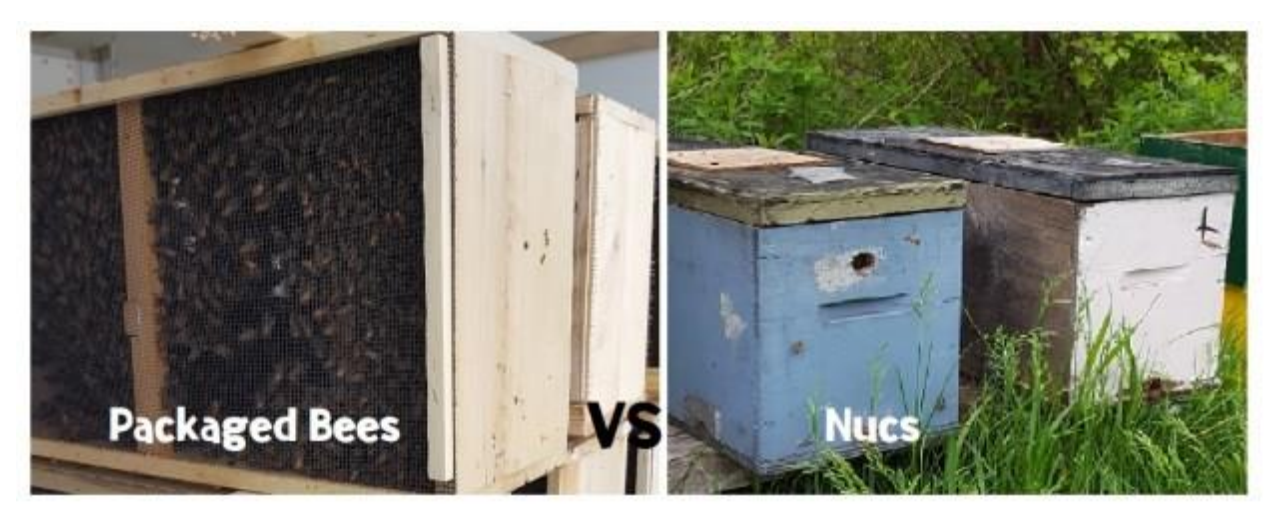
Consider the Pros and Cons of each before investing!

Typically, packaged bees are imported from the south (unless, of course, you're in the south-lol), and come in 2, 3, or 5 pound packages. You can get them with or without a Queen-beekeepers sometimes invest in a Queen less package of bees to strengthen weak hives in the spring. Basically, these are the bees and that's it. Packages are ideal for beekeepers who have lost bees during the winter, and have drawn combs leftover from previous hives.